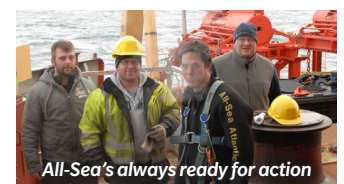
All-Sea's always ready for action

The Port of Halifax is North America's first inbound and last outbound Gateway. This convenient location, with its protected, post-Panamax berths and close proximity to specialized equipment, supplies and services, is contributing to Halifax's international reputation as a top marine services provider.