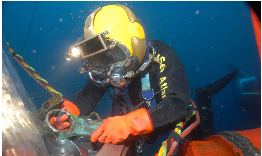
Port of Halifax offers complete, collaborative marine services above and below the waterline 24/7.

A large cargo vessel diverted into the Port of Halifax for emergency repairs. Fishing lines were tangled around its stern tube. All-Sea Atlantic quickly mobilized its expert team of divers and technicians to safely repair the stern seals underwater while the vessel was at anchor.