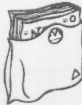
(Newspapers, office paper, flyers, envelopes, magazines, telephone books, etc)